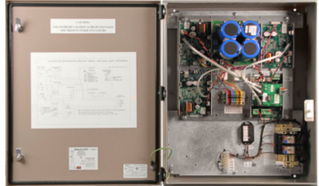
FAA E-1 MODEL